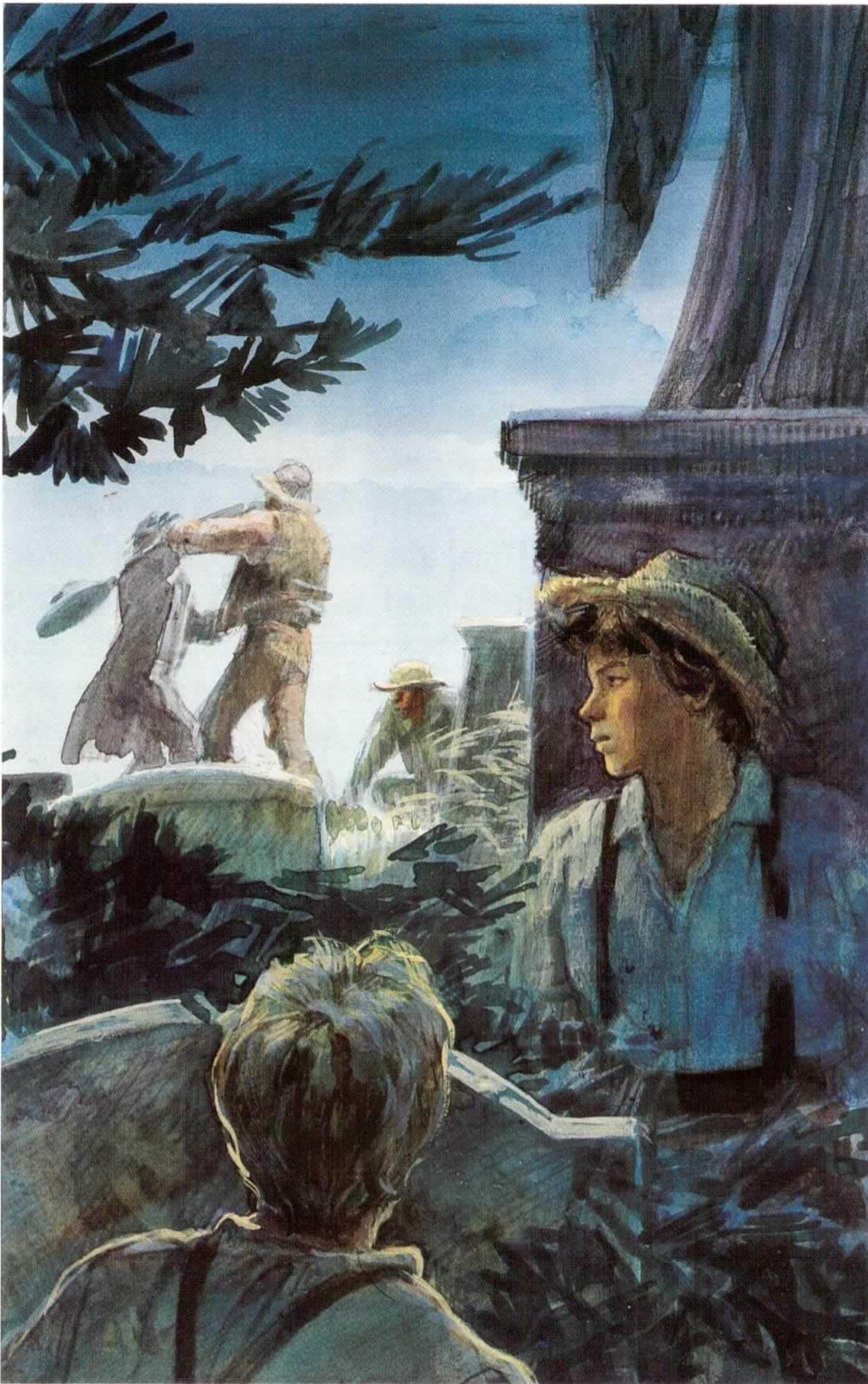
Then Injun Joe killed the doctor with a knife.

killed the doctor with a knife. Tom and Huck watched. Then they went away quickly because they were afraid.