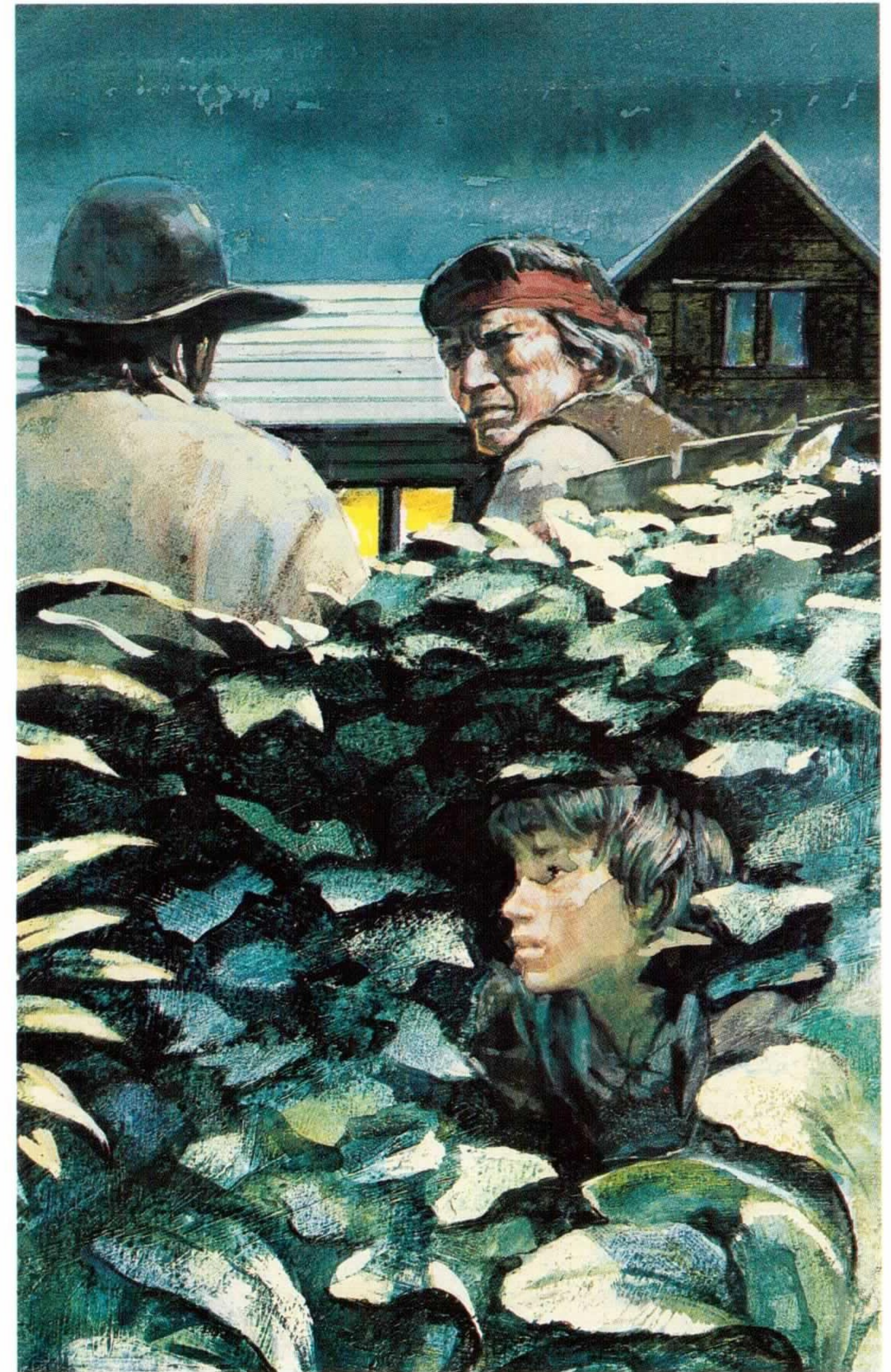
The men talked, and Huck listened to them.

"Injun Joe and his friend are in Mrs. Douglas's yard," Huck said. "They want to kill her. Can you go there and help Mrs. Douglas?"